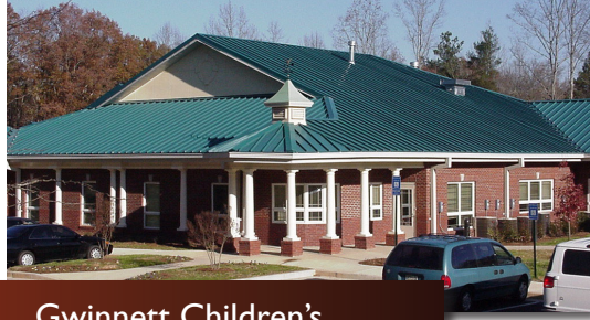
Gwinnett Children's Shelter • Buford