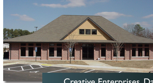
Creative Enterprises, Day Habilitation Center • Lawrenceville