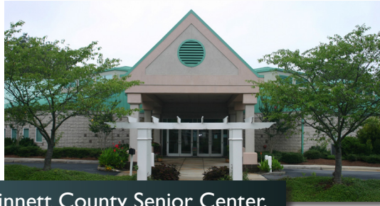
Gwinnett County Senior Center, Bethesda Park • Lilburn