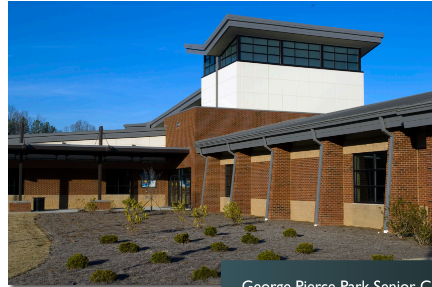
George Pierce Park Senior Center • Suwanee